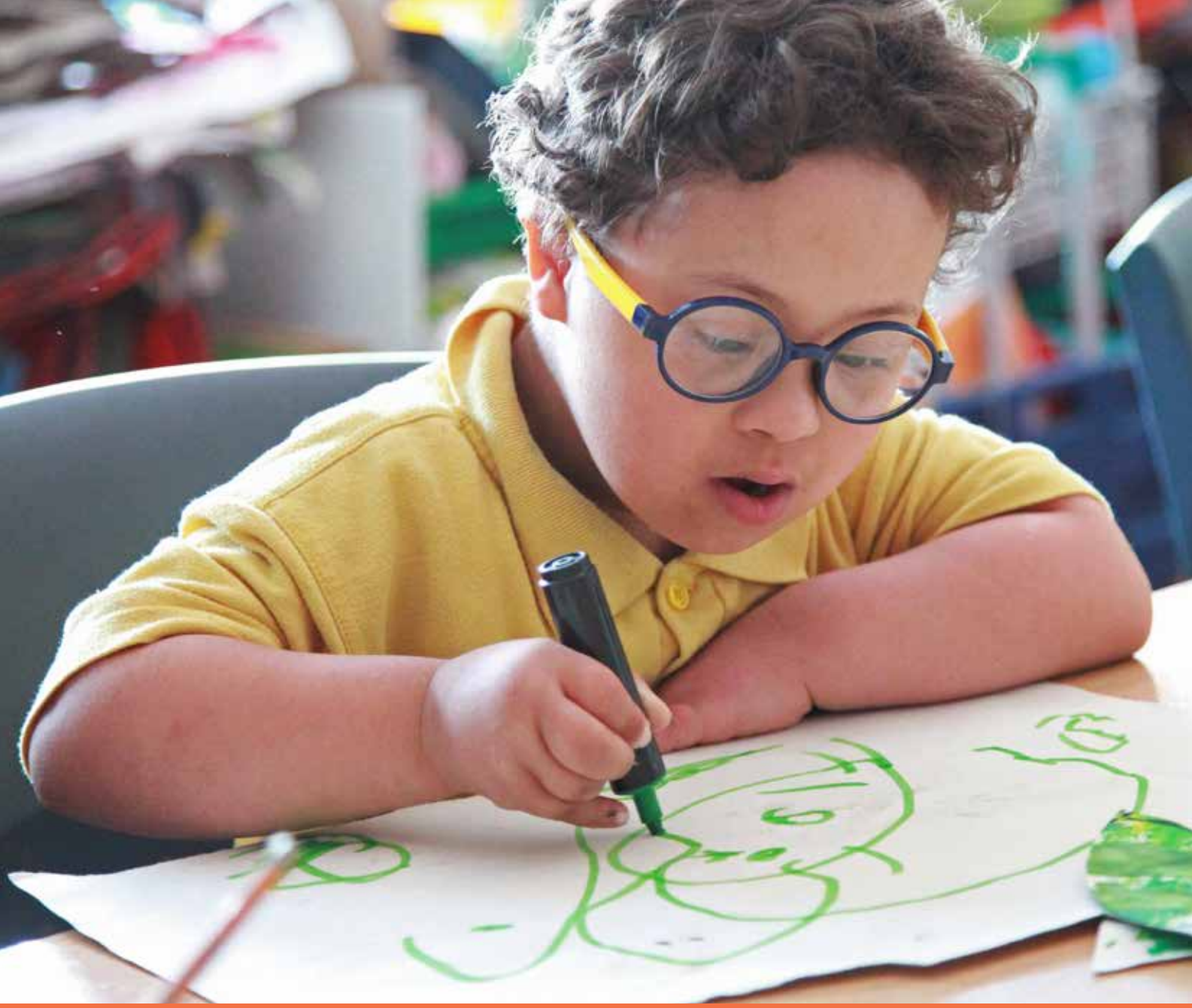
7aid can now eniov his art class because he can see more clearly

Published 10th October 2019 World Sight Day.