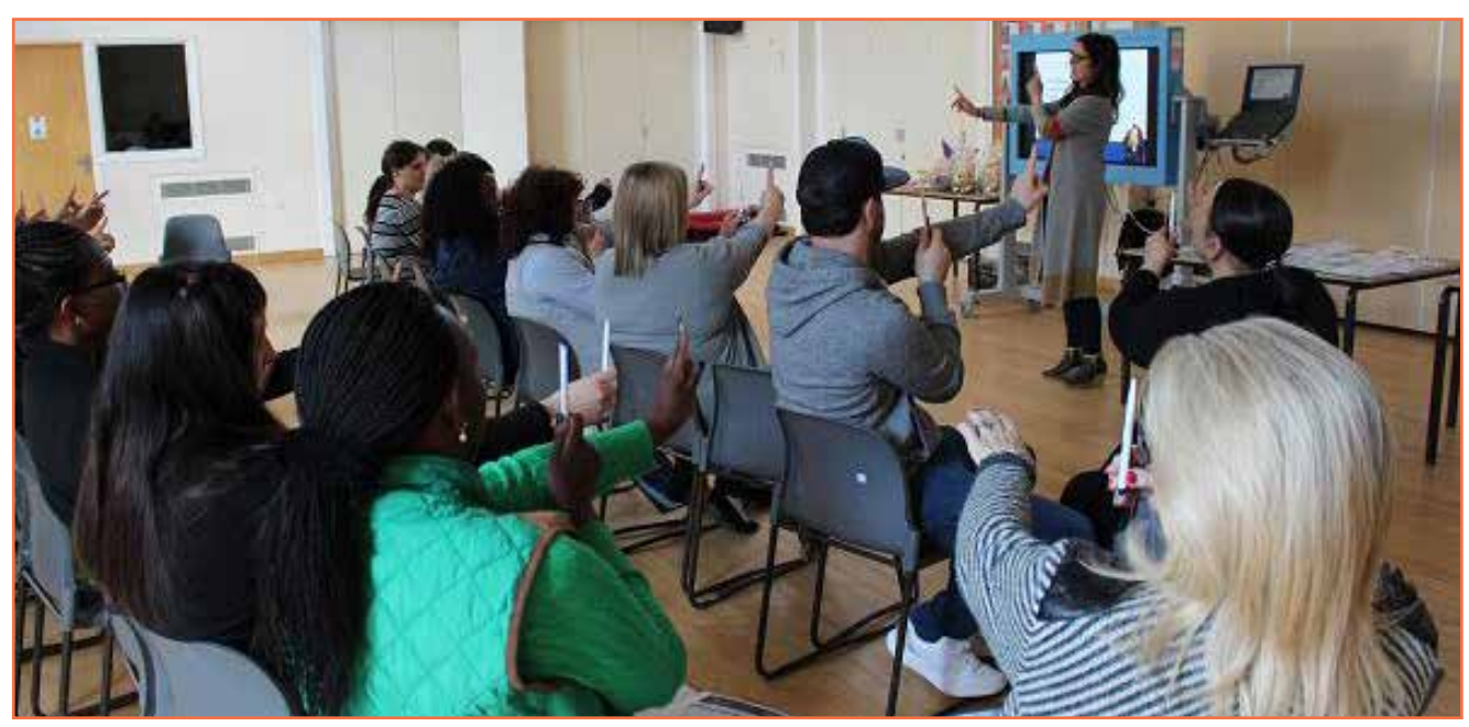
SeeAbility providing teacher training on eyes and vision at Moorcroft School

In 2019 we were also awarded funding from The National Lottery Community Fund for employing 7 people with lived or work experience of learning disability, autism and sight loss to make people with learning disabilities, supporters and professionals in London and the North West eye care aware. The Every Day in Focus project will support the roll out of the service in special schools in those areas.